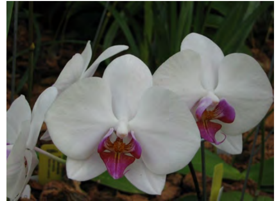
Phalaenopsis 'Happy Girl'