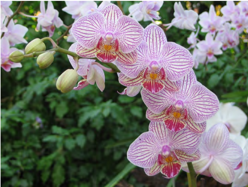
Phalaenopsis Mahogany Leopard 'Carmela' x Dtps. (Taisuco Jewel x Minh Princess) 'R#1'