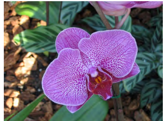
Phalaenopsis Dtps. Brother Isabel 'Lc' x Dtps (Taisuco Candystripe x Brother Brungor) 'B#20'