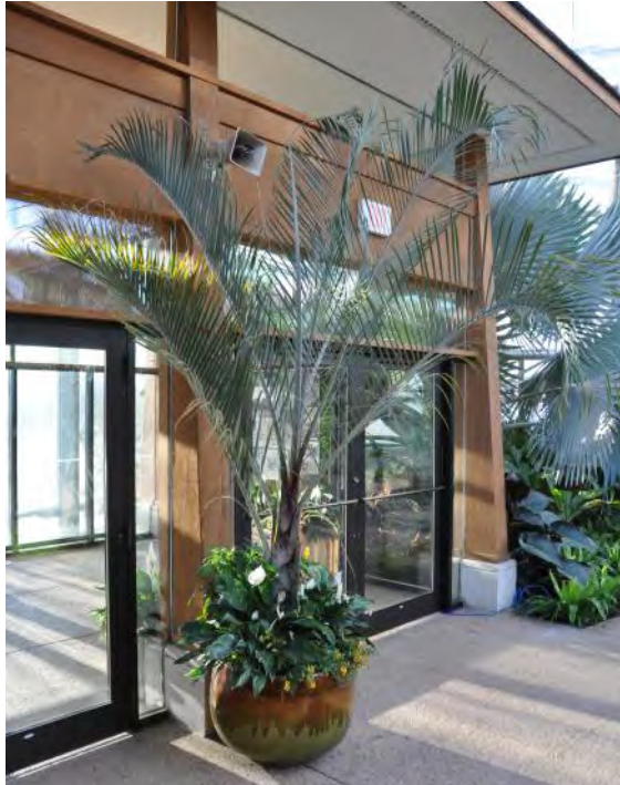
Dypsis decaryi in a container