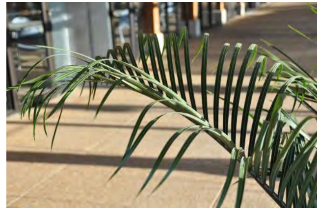
Dypsis decaryi leaf