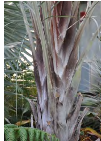
Dypsis decaryi triangular trunk