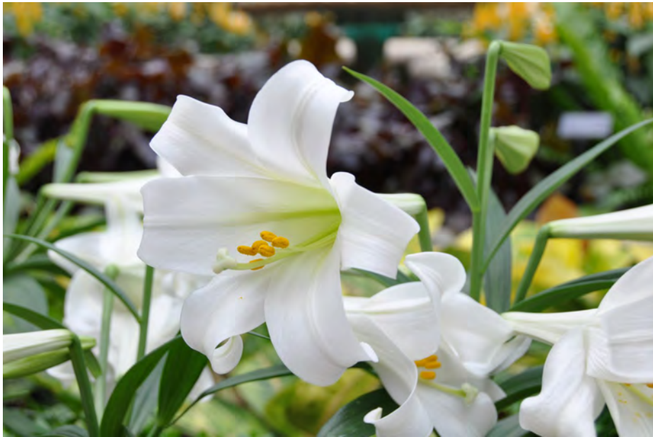
Lilium longiflorum 'Nellie White'