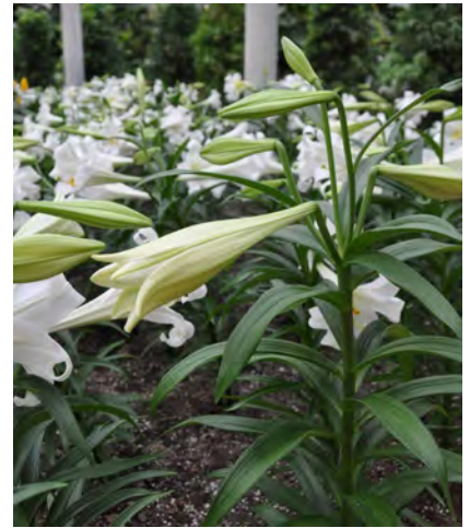
Lilium longiflorum in bud