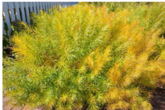
Amsonia hubrichtii Fall Color