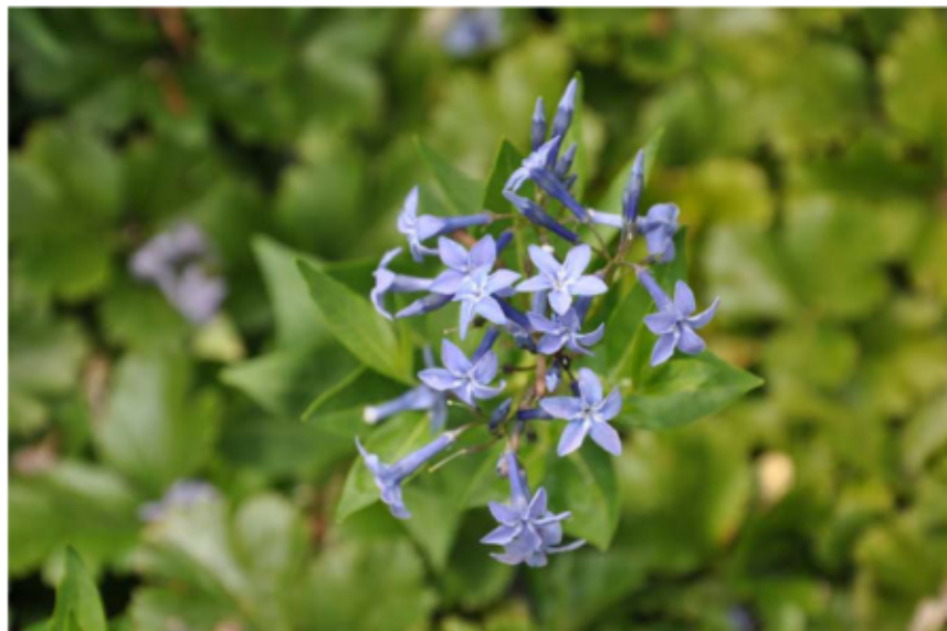
Amsonia 'Blue Ice'