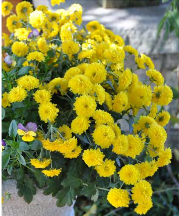
‘Gold Rush Yellow’