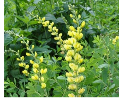
Prairieblues™ Solar Flare