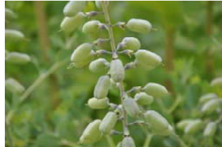
immature seed pod