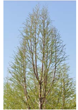
Shawnee Brave™ With emerging foliage