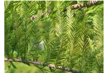
Summer ↑ & Fall ↓ Foliage