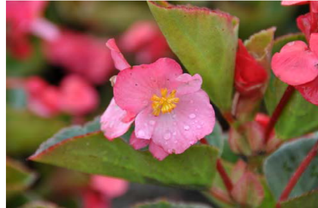
'Big Bronze Leaf Rose'