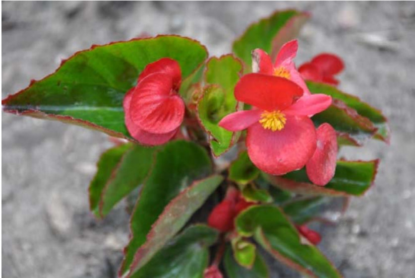
'Big Green Leaf Red'