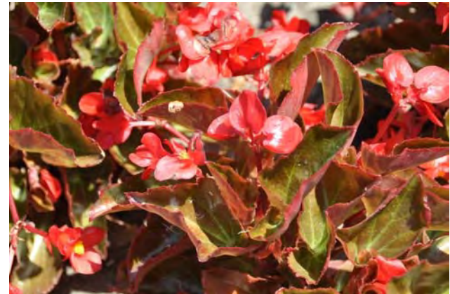
Big Red Bronze Leaf Improved