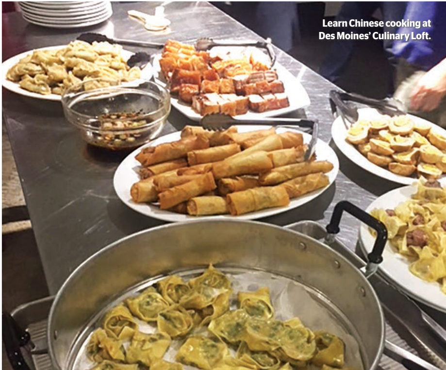
Learn Chinese cooking at Des Moines' Culinary Loft.