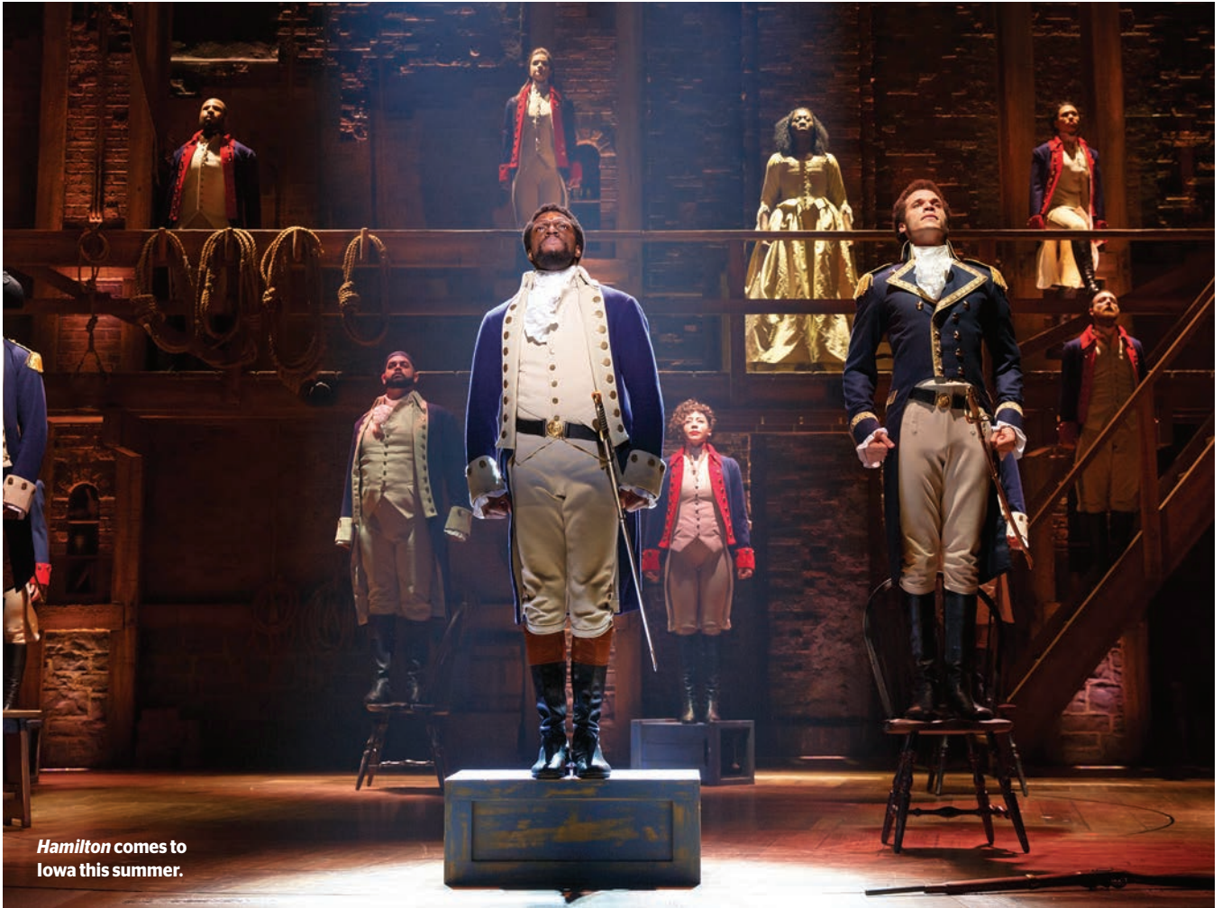
Hamilton comes to Iowa this summer.