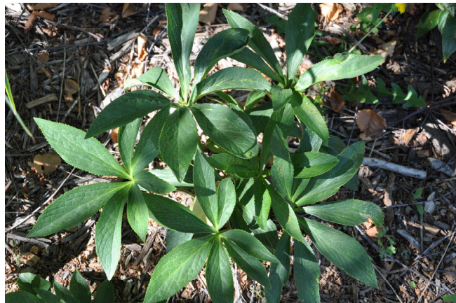
Above left: palmate leaves seen throughout the summer