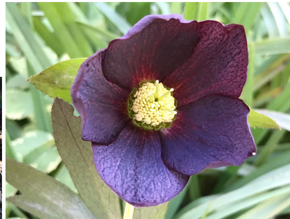
Above right: the flower of 'Black Diamond'